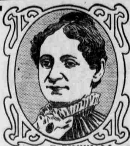
LYDIA E. PINKHAM