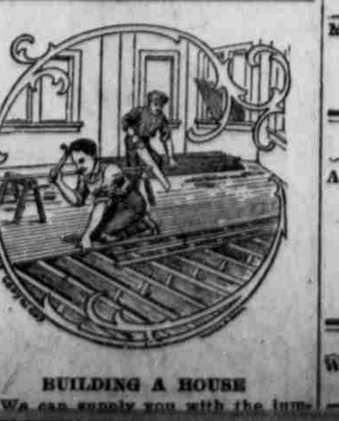
BUILDING A HOUSE We can supply you with the lumber

A. L. FRASER 256 State Street. Phone 135.