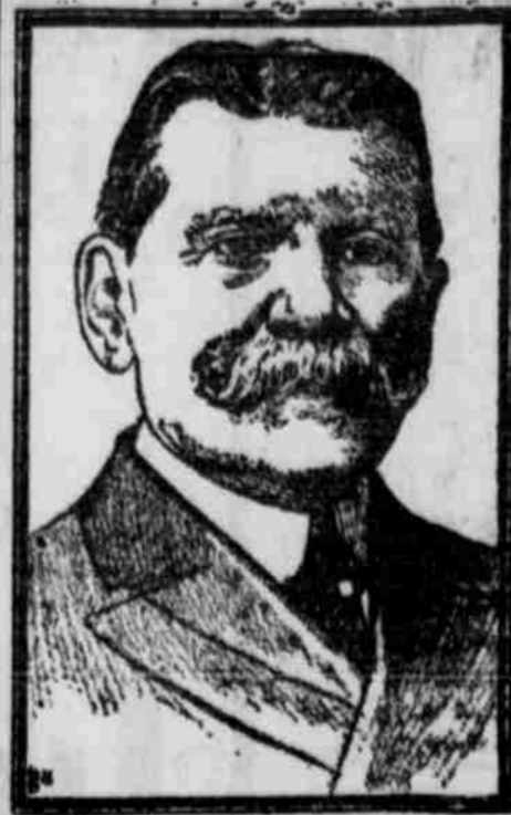
HORACE PORTER. Ex-ambassador to France and one of Uncle Sam's delegates to The Hague peace conference in June.