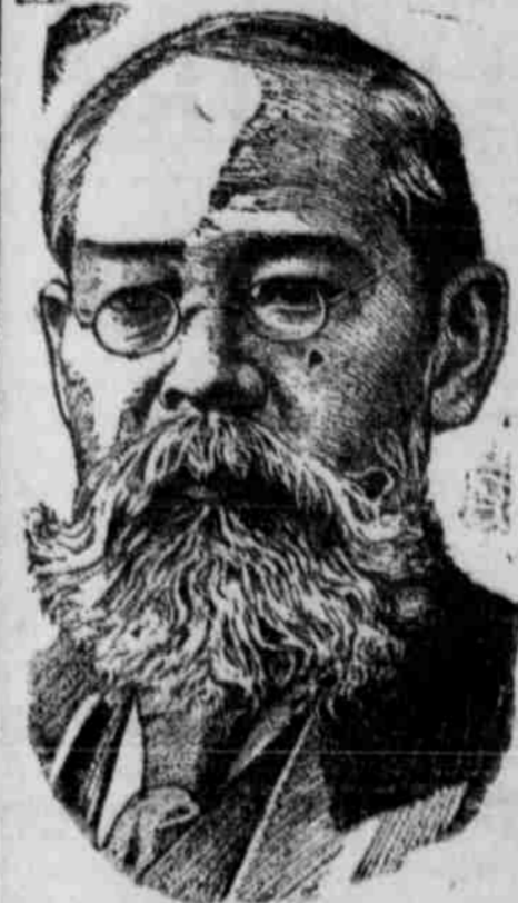
VISCOUNT AOKI. Japanese ambassador to the United States, noted statesman and diplomat. Married a German woman.

Japs Are All Right. Tokio, June 15.—Minister Hayashi, at a conference of statesmen, announced that the last incident in connection with the alleged attacks upon San Francisco Japs was too trivial to warrant diplomatic action. He declared that Washington and Tokio were in complete accord.