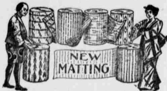
New Government Inspected Mattings just received

THE HOUSE FURNISHING CO. 177 LIBERTY ST.