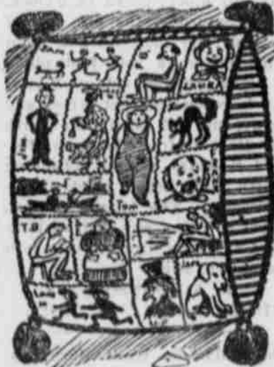
THE "ART" SOFA PILLOW.

A most unique sofa pillow cover can be made by a girl to add to the many little artistic and odd furnishings of her den. Invite each girl and boy friend to draw a conical picture on a piece of heavy white, tan or light blue linen, about 3 by 4 inches in size. There should be an equal num-