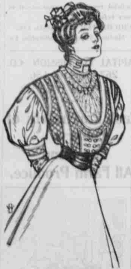
A NEW BLOUSE.

One of the smartest and prettiest of the season's novelties is a set of ec-