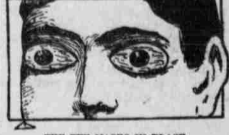
THE EYE MASKS IN PLACE.

Easy Way of Masking Yourself With Two Almond Shells. Here is an easy way to disguise yourself and have fun with your playmates: Take two half shells of an almond, large enough to be held between the upper eyelid and the cheek. Bore a small hole in the middle of each one a little larger than the pupil of the eye. You must do this with the sharp end of a penknife, as such a tool as a gimlet will crack the nut. The inside of the shells should be thoroughly cleaned. Paint the outsides white with water colors. You can use oil colors if you like, only water colors.