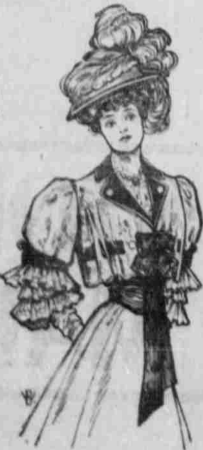
WHITE PARACAL BOLEDO.

There is a new plume that heretofore has been hidden away in the feather dustier—the turkey feather—fluffed up and glorified. It is called imitation marabou and is sold in clusters of every conceivable color. It is much