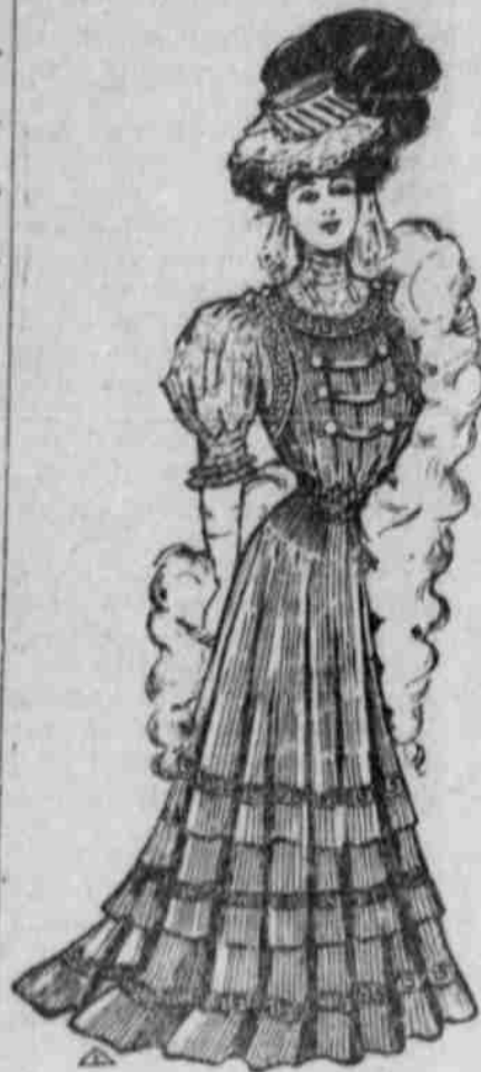
FRONT OF STRIPED VOILE.

The dominating colors of the season are green, brown, lemon yellow, old