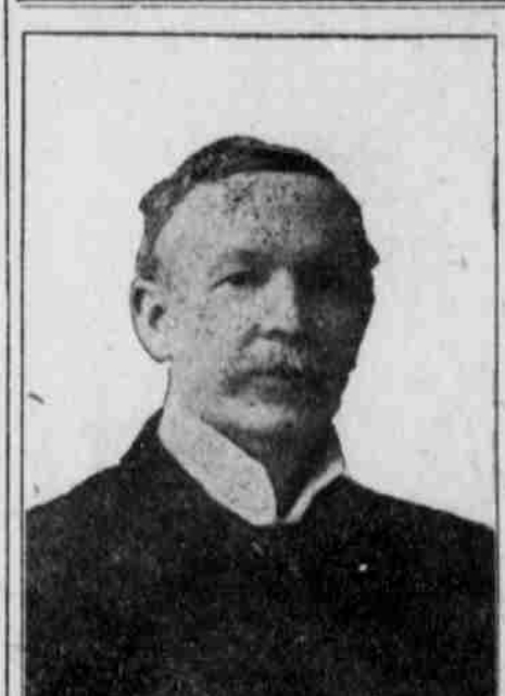
DR. STONE'S DEUG STORE

cure the disease. Easy to take as candy-