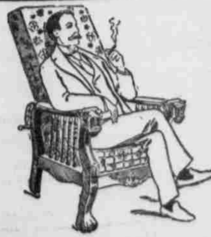
MORRIS CHAIRS $7.50 and up.

And as well as a permanent one. There is no gift you can give more pleasing to any home than a fine Rocker, Morris Chair, Writing Book Case, Parlor Stand or a Fine Birds-Eye Maple Dressing Table.