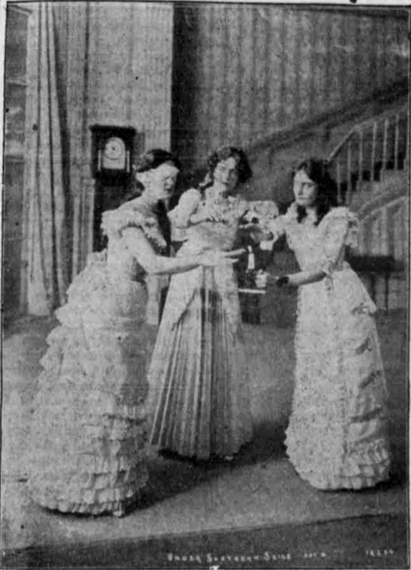
Scene in "Under Southern Skies."

All the sunshine of the south, all the heaven's blue, just so there is a chivalry of its gentlemen, all the sweet and low cadence associated