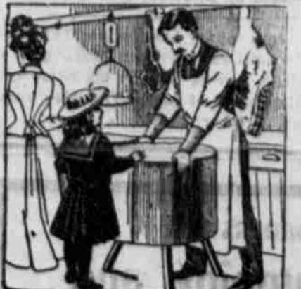
A CHILD CAN BUY

As advantageously at our meat market as the older folks. We give the most careful attention to all orders, and sell none but the best of meats.