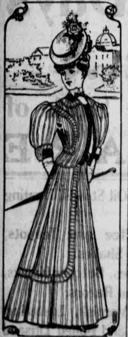
GOWN OF STRIPED WOOLLEN.

In French linen shirt waists there is a new model with small box plaits running from neck to waist. These plaits are pressed, but not attached. The sleeves are arranged in the same