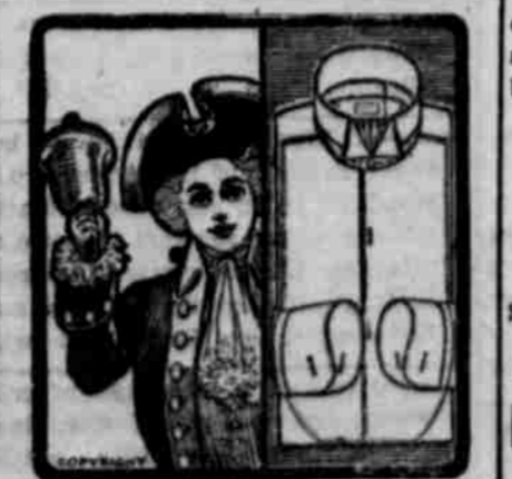
THE TOWN CRIER

that he lauded must have been the picture of our fine legs of prime lamb and mutton. "The haunch was a picture for painters to study, The fat was so white and the lean was so ruddy." Expert judges of prime and juicy meats are always delighted with the choice cuts that we send to their order from our stock of fine meats. We handle nothing but the best. E. C. CROSS