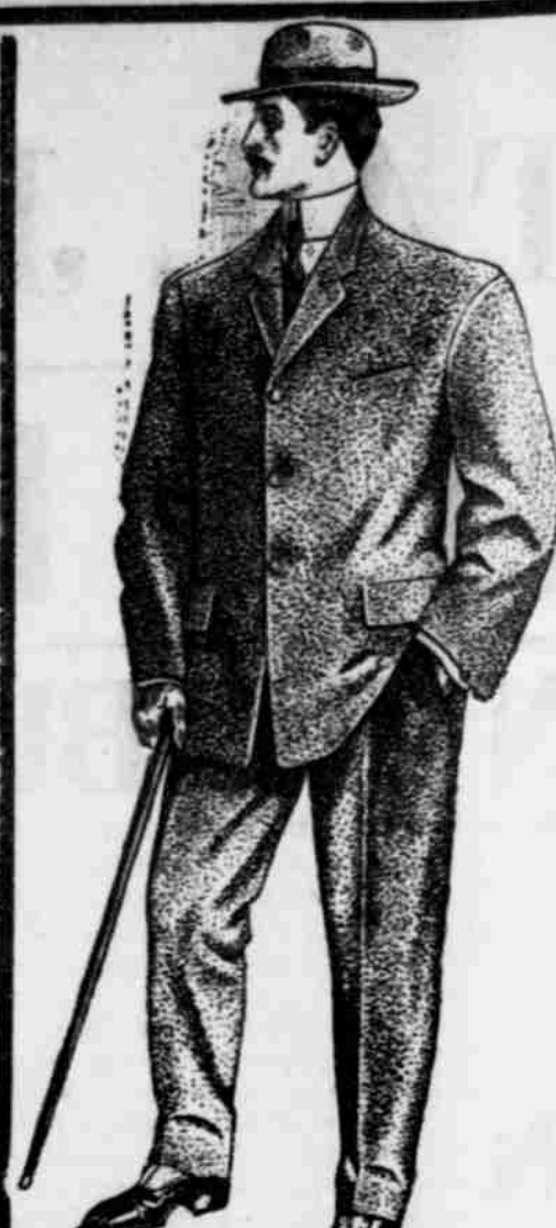
Designed by SCHLOSS BROS. CO. Fine Clothes Makers. Baltimore and New York

The exposition includes the most interesting display of the various processes used in the manufacture of textile products and allied industries, machinery, for steam, electrical and hand or foot power, auxiliary machinery and appliances used in spinning or weaving, machinery used in various mechanical and electrical industries, exhibits connected with social economy and hygiene, etc. France, Germany, Great Britain, the United States and many smaller countries of Europe and other parts of the world are represented in machinery and appliances for harvest, includes, particularly, electrical machinery and appliances for the harvest-