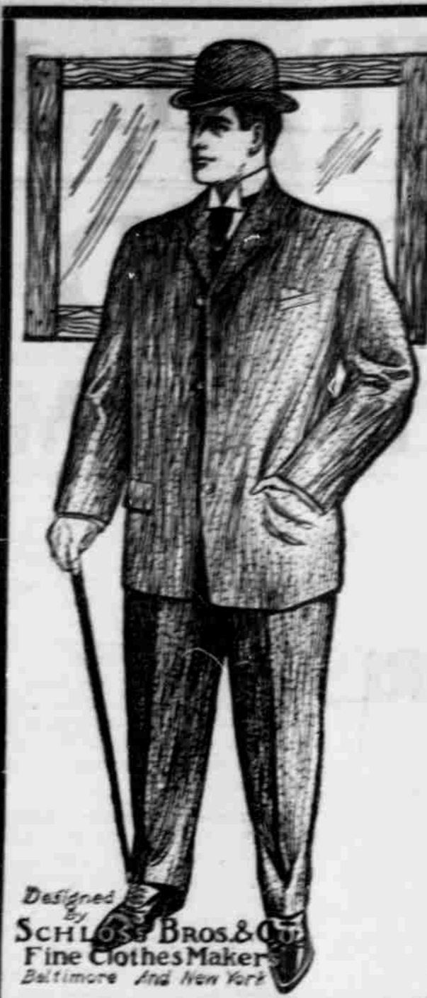
Designed by SCHLOSS BROS. & CO. Fine Clothes Makers Baltimore and New York

The University of Oregon won the track meet at Columbia university Saturday. There were about 400 present to witness the struggle for supremacy between the State university and the Oregon Agricultural college. Willamette university had but one repre-