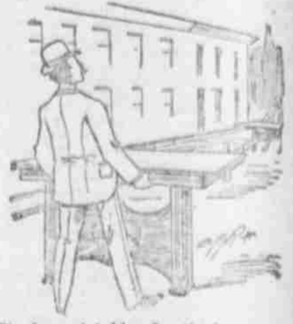
The largest tables for the least money.

Our stock of furniture throughout was never before so complete, and offers many suggestions for the holiday season.