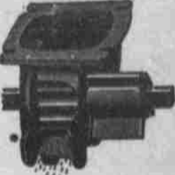
Feed Wheel Set For Large Quantity.

SPEAKING ABOUT TIME TRIED DRILLS THE HOOSIER DRILLS HAVE BEEN MANUFACTURED FOR FIFTY YEARS, AND HAVE BEEN SOLD IN OREGON FOR THIRTY-EIGHT YEARS, AND ALWAYS GIVEN PERFECT SATISFACTION. THE HOOSIER HAS THE ONLY ABSOLUTE FORCE FEED USED ON ANY DRILL, AND DISTRIBUTES THE GRAIN EVENLY AND NOT IN BUNCHES. BY USING A HOOSIER YOU WILL NOT SEE THAT WAVY APPEARANCE IN THE FIELD WHEN THE GRAIN IS COMING UP OWING TO IMPROPER DISTRIBUTION OF GRAIN. NOW, AGAIN SPEAKING ABOUT EXPERIMENTS, OF THE LIGHT AND TRASHY KIND OF DRILLS WITH LIGHT WHEELS, LIGHT FRAMES AND LIGHT SPRINGS, THEY ARE NOT TO BE COMPARED WITH THE HOOSIER IN ANY RESPECT.