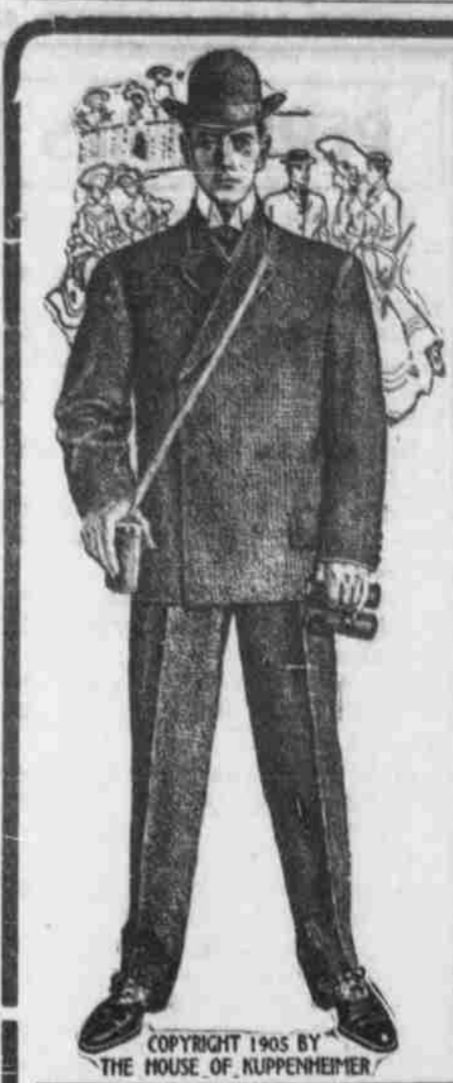
COPYRIGHT 1905 BY THE HOUSE OF KUPPENHEIMER