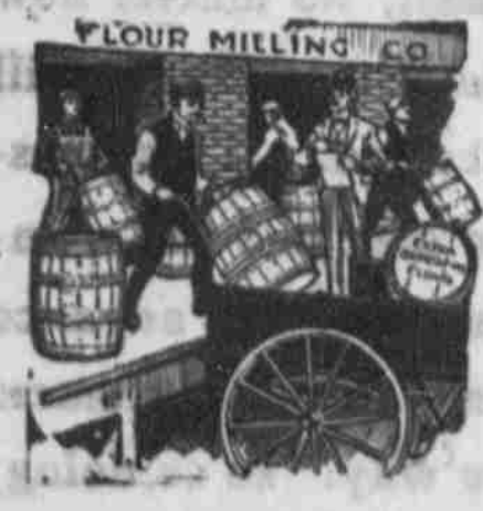
A BUSY DAY

If we keep in mind a regal throne, like that of an earthly monarch, only more magnificent, as befits the Deitya celestial pince, a train of angelie courtiers and then place Christ on a far-away throne at the right hand of such a God, sitting in regal majesty, we tance and in sympathy and communion, but we externalize and materialize the of the Omnipresent God, everywhere revealing Himself-the Immanent Deity,