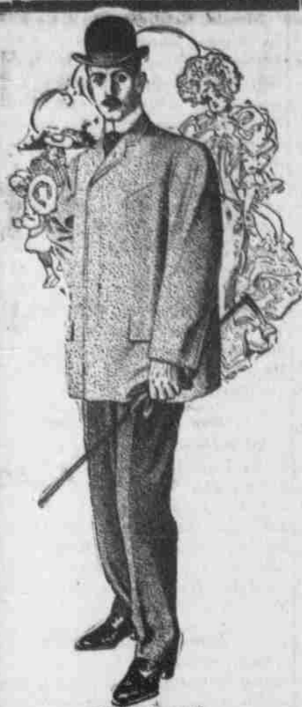
COPYRIGHT 1905 BY THE HOUSE OF RUPPENHEIMER