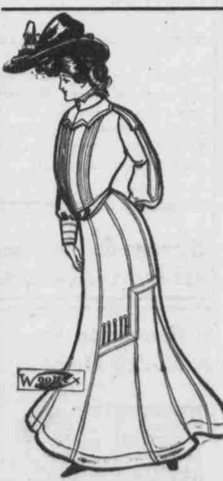
Ladies' Ready-to-wear Garments

Strenuous efforts are in force to clear all suits, skirts, capes, coats and waists immediately. The amazing reductions below indicate the savings we are offering on the latest style garments. $20.00 suit or coat now priced at $10.00 $30.00 suit or coat now priced at $15.00 $40.00 suit or coat now priced at $20.00