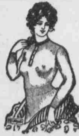
"MÉRODE" (Hand Finished) UNDERWEAR

Many of our spring silks are being shown, and in point of variety, and beauty they excel any previous showing. Brand new Kai Kai Silks of the very newest patterns, colors and designs are being offered at this early date. They are regular 50c grades. Special ..... 25c