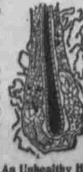
An Unhealthy Hair.