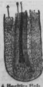
A Healthy Hair.