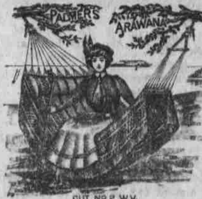
CUT NO 2 W.V.

Just the thing for office shades---They let the air through but obstruct the view and heat from the sun.