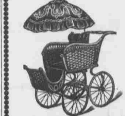
THIS RECLINING GO-CART $11.00 complete with cushion and parasol, rubber tires.