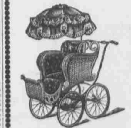
THIS RECLINING GO-CART Complete with cushion and parasol $18.50, rubber tires.