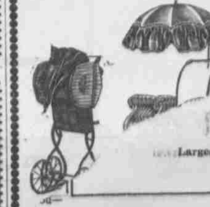
THIS RECLINING GO-CART Complete with cushion and parasol and