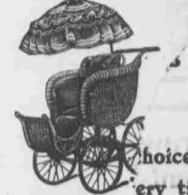
THIS RECLINING GO-CART $16.50 complete with cushion and parasol, rubber tires.