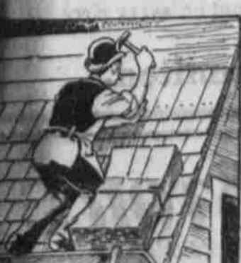
Shingles and Shakes

Little and Often Fills the Purse. A FEW BARGAINS THAT HELP. 50 lb. Sack Corn Meal, Regular Price $1.15, now 90c. 100 lbs. Oyster Shell, ground, Regular Price $2, now $1.50 Mixed Hay, good quality, 60c. per 100 lbs. $11.00 per ton Other goods in Proportion. Free Delivery. Prompt Service. Reliable Goods. D. A. WHITE & SON, Feedmen and Seedmen, Phone 1781. 91 Court Street, SALEM, OREGON.