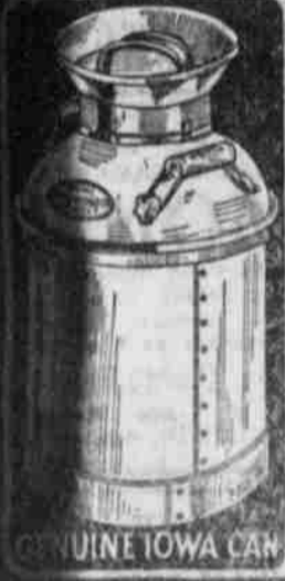
GENUINE IOWA CAN