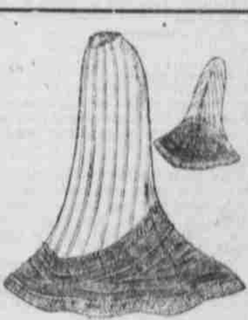
New Stylish Skirts $2.15 to $30.00 All Good

Skirts in great variety and values too, in the present sale of skirts there are more than a hundred styles. When you consider that each represents the utmost value that it is possible to give at the price-better by far than has ever been given before-and you'll understand why this sale is making such a record if you call and on the value offerings which we are offering you.