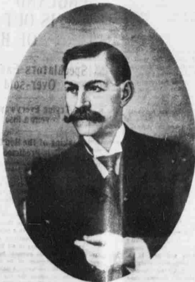
HON. FRANK DAVEY.

"I have always been and am a firm advocate of the Isthmian canal as early a date as possible. I have always shared the general western preference for the Nicaragua route, but I feel that the great advocates of the Panama route must have good, respectable reasons for their belief..."