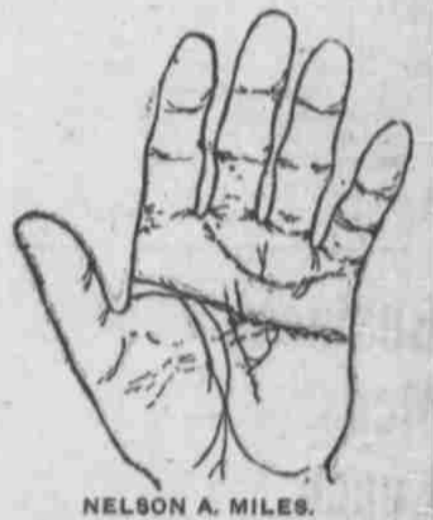
NELSON A. MILES.