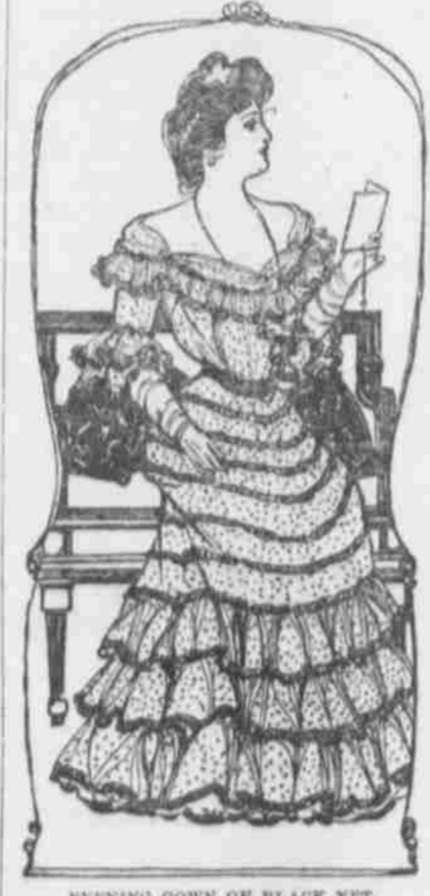
EVENING GOWN OF BLACK NET.

Fur garments are very sumptuous this year, or rather, sumptuous looking, for the most inexpensive furs are now being made into lovely garments. Women have hitherto looked with contempt upon marmot and squirrel, but these now figure in chic little boleros. Squirrel has to be treated with care and is greatly improved by the addition of some ermine edging and some good lace gimpure. There is a perfect craze for velvet, both plain and spotted, for day and evening wear. The rough fur coats are mostly three-quarter length for motoring and other purposes. The more sumptuous forms of carriage wraps are full length, which is a wise proceeding, as they can then be used for evening coats.