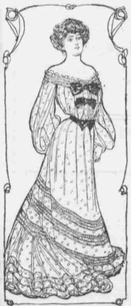
A WHITE POINT D'ESPRIIT GOWN.

Russian Blouse Costumes Are Very Popular For Young People. The Russian blouse costume is decidedly popular with the young and slender, and there are many charming novelties in make and finish. The newest Russian blouses have hoodlike collars with trimmings around the shoulders or are collarless and trimmed flat, and this fashion admits of charming