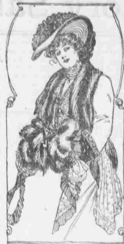
BLACK PANNE HAT.

Three Cornered Hats—Picture Millinery. The three cornered hat is again in vogue. It comes well down on the hair at the back of the head and is elevated by a bandeau in front, taking a peculiarly beautiful line when the hat is equally well understood by both the designer and the wearer. Some very smart examples of this are in green and in black beaver. Fashion decrees that the tailor made hat shall match the gown with which