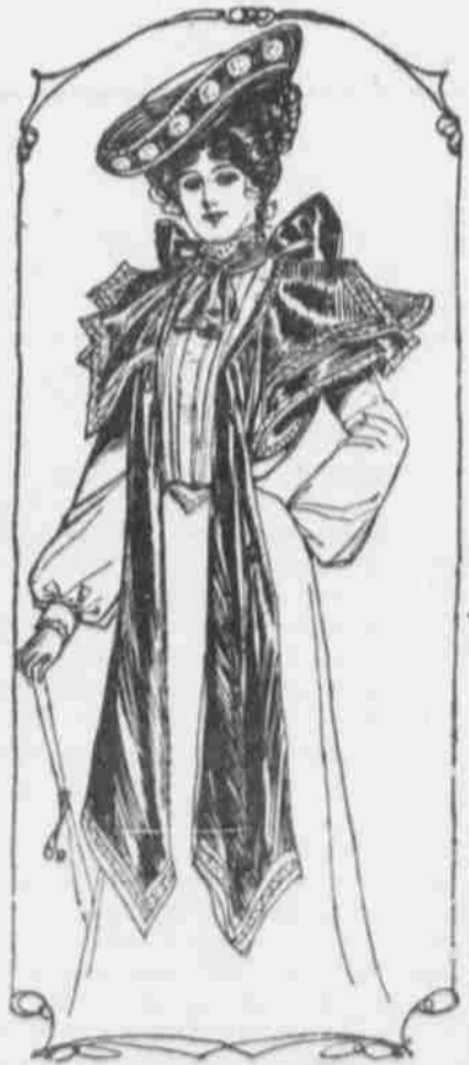
A TAFFETA STOLE.

Cloth Coats Trimmed With Strappings—Fur Models. Cloth much trimmed with flat braidings, grouped stitchings or strapplings of the material is quite the fashion for coats, and some models have an addition of fur. Furriers are showing less of the bushy type of furs, and ermine is again modish, but is used chiefly as a garniture for dark furs. White and blue fox figure on sumptuous evening wraps and as stoles and boas with velvet and fur cloth gowns. The tender graduations of gray shown