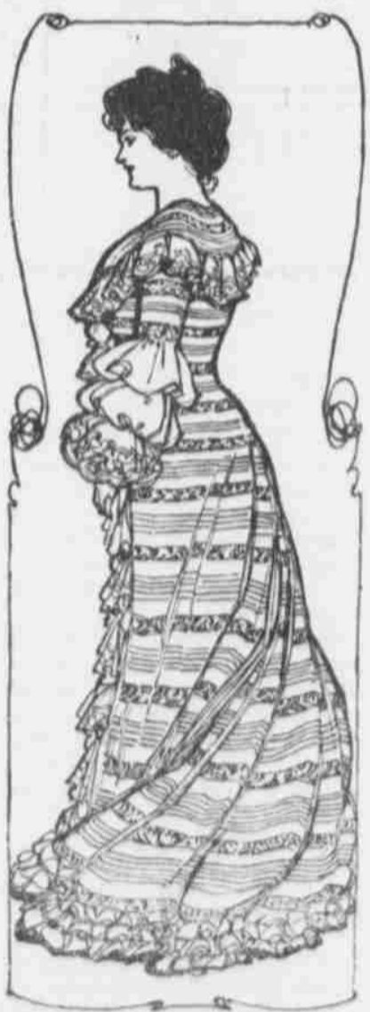
FRENCH HOUSE GOWN.

Little Things Which Transform a Gown. There is a pretty notion in Paris just now to take away the slight appearance of the collar by little clusters of velvet ribbon on each side toward the front. It is easier to remodel an old costume this season than ever before. For instance, an old sleeve may be made quite modish by cutting it at the elbow and putting in a puff of silk or lace. The wide collars so universally becoming are a little out of date, but