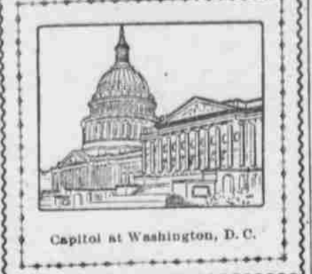
Capitol at Washington, D. C.