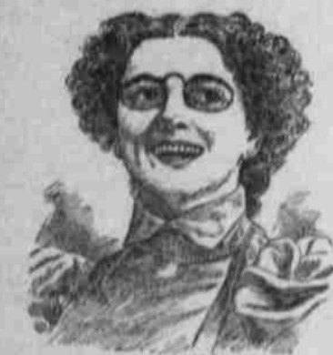
A Delighted Woman

Or man you will be, if your sight has been failing to see. How perfectly we can restore it with a pair of our fine French crystal or Brazilian poble eye-glasses or spectacles, after we have tested your sight and adjusted them to remedy defects.