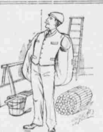
I do Good Paper Hanging, Decorating and Painting as cheap as you can have second-class work done. Leave orders at my shop, 153 Court st., or with Buren & Hamilton, on Commercial.