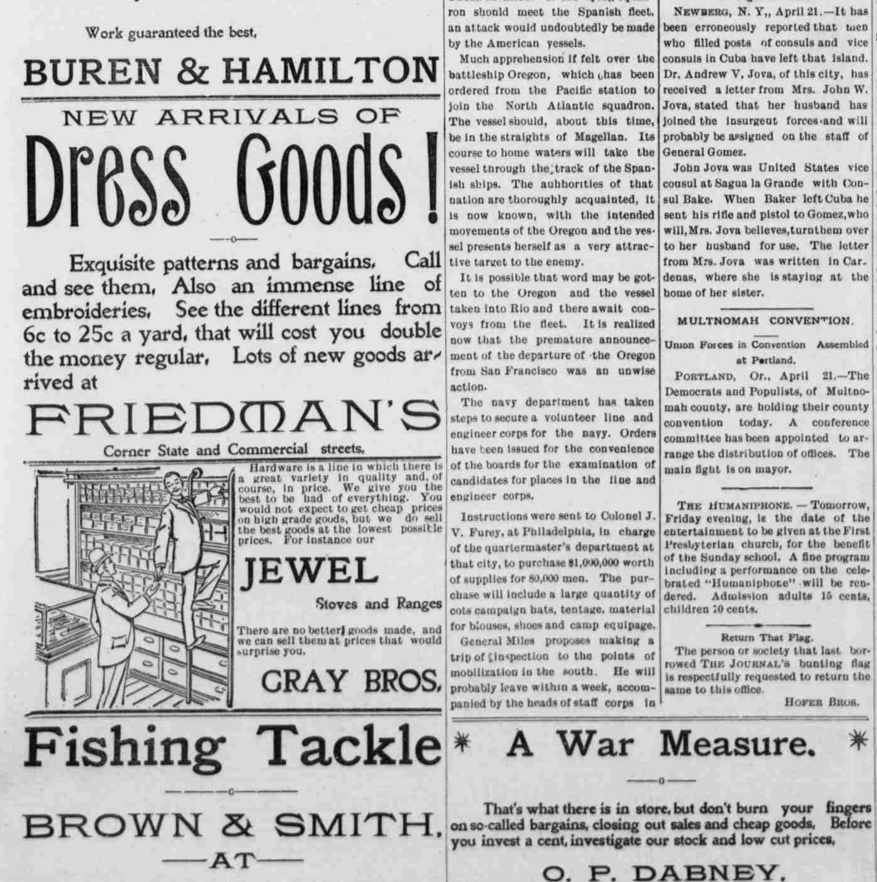
Chart H. Flitchers

256 Commercial Street, Are headquarters for fishermen's supplies,