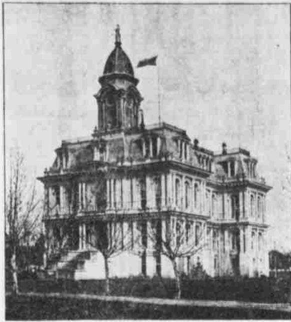
MARION COUNTY COURT HOUSE.

[Recently reconstructed by Pugh & Gray, architects, Salem, Or.]