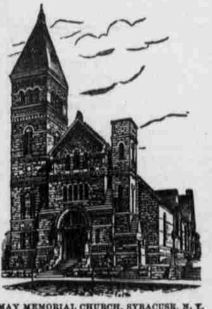
MAY MEMORIAL CHURCH, SYRACUSE, N. Y. These pills are manufactured by the Dr. Williams' Medicine Company, Schenectady, N. Y., and are sold only in boxes bearing the firm's trade-mark and wrapper at 50 cents a box or six boxes for $2.50, and are never sold in bulk. They may be had of all druggists or direct by mail from Dr. Williams' Medicine Company. The price at which these pills are sold makes a course of treatment inexpensive as compared with other remedies.—From the Evening News, Syracuse, N. Y.

Dr. Williams' Pink Pills for Pale People have an enormous sale, and from all quarters come glowing reports of the excellent results following their use. An analysis proves that they contain in a condensed form all the elements necessary to give new life and richness to the blood and restore shattered nerves. They are an unfailing specific for such diseases as locomotor ataxia, partial paralysis, St. Vitus' dance, sciatica, neuralgia, rheumatism, nervous headache, the after effect of influenza, palpitation of the heart, pale and sallow complexion, that tired feeling resulting from nervous prostration; all diseases resulting from vitiated humors in the blood, such as scrofula, chronic erysipelas, etc. They are also a specific for troubles peculiar to females, such as suppurations, irregularities and all forms of weakness. They build up the blood, and restore the glow of health to pale and sallow cheeks. In men they effect a radical cure in all cases arising from mental worry, overwork or excesses of whatever nature. There are no ill effects following the use of this wonderful medicine, and it can be given to children with perfect safety.