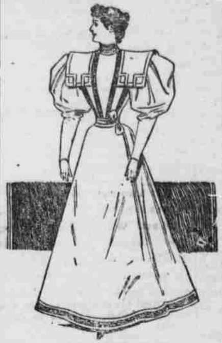
AN AUTUMN NOVELTY.

Four bands of lace, inserted in the close fitting bodice, divide the latter into five strips, each one of which tapers to the waist. Large epaulets of rich brown velvet fall over the shoulders.