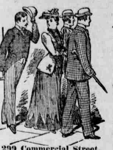
299 Commercial Street.

JUST NOW There is going to be a rush for CLOTHING For Holidays, etc., and remember the WOOLEN MILL STORE Is the place to buy and get the best goods for the least money. 299 Commercial Street.