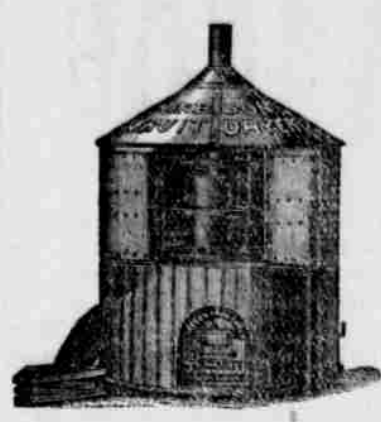
It is Easy to Operate and Econemical in Fuel.

Awarded first premium at the Oregon State Fair in 1885, 84, 85, '86, 87, '85, and at the California State Fair in 1887, and the San Joaquin county Fair in 1887, awarded Grund Silver Medal at the Portland Mechanic's Fair in 1888, Manufactured in seven sizes. For circular and price list address H. S. JORY & SON, Salem, Or. Postoffice box 286.