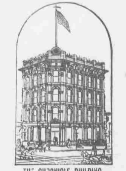
THE CHRONICLE BUILDING.

THE SAN FRANCISCO CHRONICLE is the first paper on the Coast in ability and in the freshness and reliability of its NEWS. Nothing that the world desires to know is omitted from its columns. Its Telegraphic Reports are the latest and most reliable, its Local News the fullest and spiciest, and its Editorials from the ablest pens in the country.