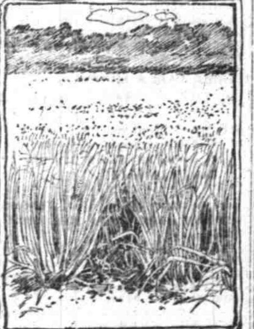
ONION FIELD IN AUGUST. (Four months from planting.)

I drill seed in rows one foot apart. After they are up so the rows can be seen cultivating must be commenced at once. For this purpose I use a double wheel cultivator that works astride the row, working up close to the plants, therefore leaving only the weeds that grow directly in the row. After the