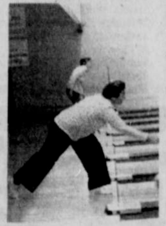
It doesn't matter if you're a beginner or pro, the excitement stays the same. So come on down and join us, it's fun! By Barbara Garner

throw 2 more to complete this 10th frame. So you take a deep breath, somehow make your feet move forward and it's in the pocket again! Then one more time you stagger up there, everyone is watching and you hit your third strike in a row. Wow, I did it!! You get your name announced, go up to the desk for your 200 pin and then go back down and collapse!! There you are, worn out, feeling pretty darned proud knowing you did it before, you can do it again!!