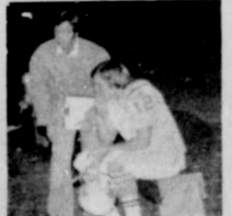
TD. The kick was no good.