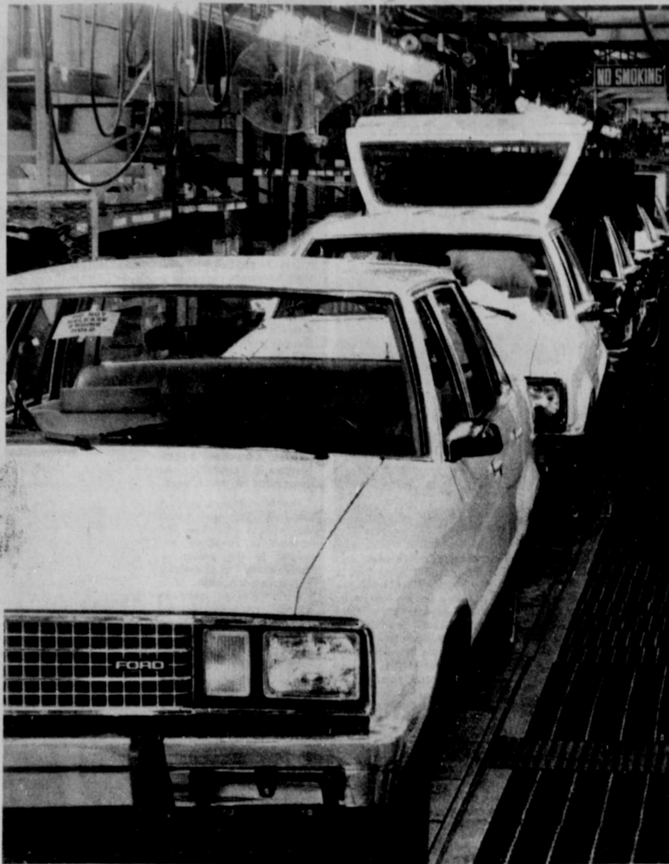
TWO FIRSTS —The domestic auto industry's first 1978 models and the first of more than 400,000 new Fairmonts Ford Division hopes to sell during the coming year were produced at Ford's Kansas City Assembly Plant last week. Ford dealers plan to introduce the Fairmont, a new line of compact mid-size cars in early October. Ford assembly plants in Georgia, New Jersey and Ontario, Canada, also will build the car.