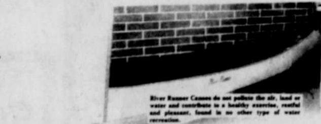
Canoe on display in Nyssa at the U.S. Bank from July 7th to 19th and at the First National Bank July 20th to 30th.

Have a Hankerin' to be an Admiral? YOU CAN BE WITH A