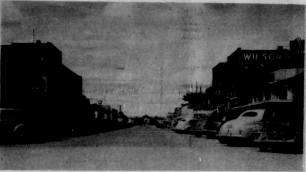
Main Street of Nyssa, 1952