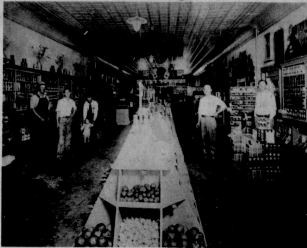
Wilson Brothers Store