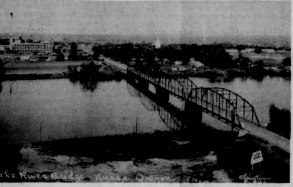
Old Snake River Bridge, 1953