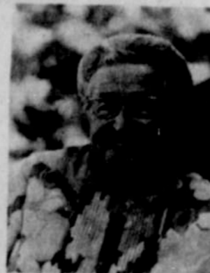
Corrie Ten Boom

"Corrie: Behind the Scenes with The Hiding Place," a new full-length color release from World Wide Pictures, will be shown at the Owyhee Community Church on Owyhee Avenue on Sunday, May 8, Mother's Day. A single showing is scheduled at begin at 8 p.m.