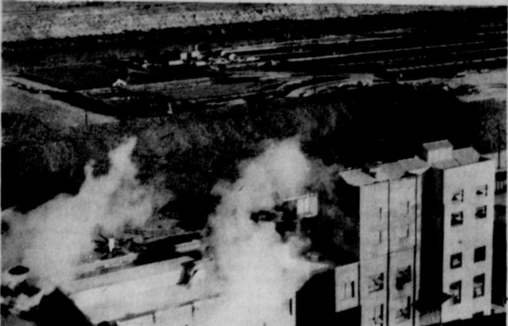
Amalgamated Sugar Factory