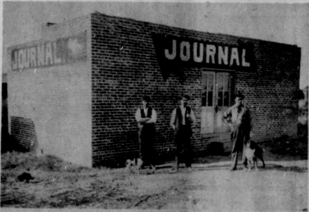
Nyssa Gate City Journal