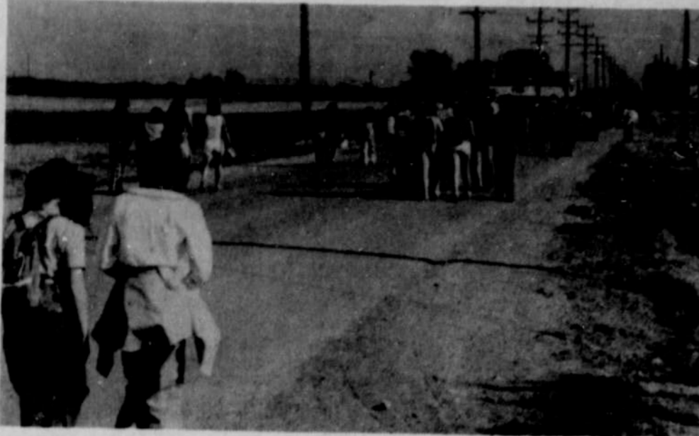
NORTH THIRD STREET WAS LINED from side to side with walkers Saturday morning as the March of Dimes Walkathon got underway. Nyssa had 225 Walkers and earned pledges of over $5,000 and Adrian entered 43 walkers and pledged over $1,000. Winners of prizes will be announced in next

A similar cost study was made for a storm sewer