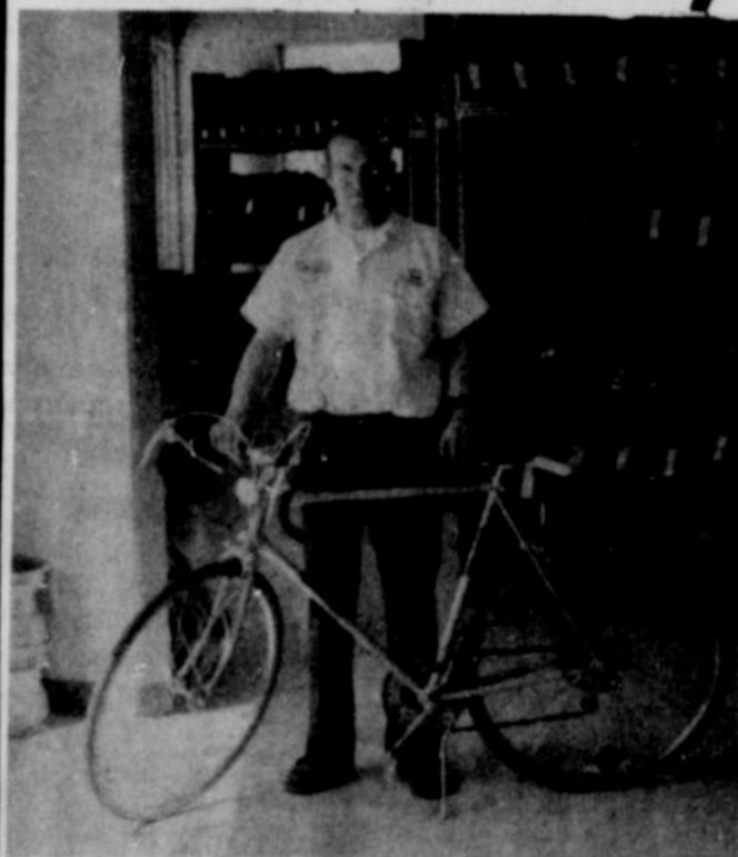
Don't forget to register for the FREE BIKE to be given away at 4 p.m. April 23rd.