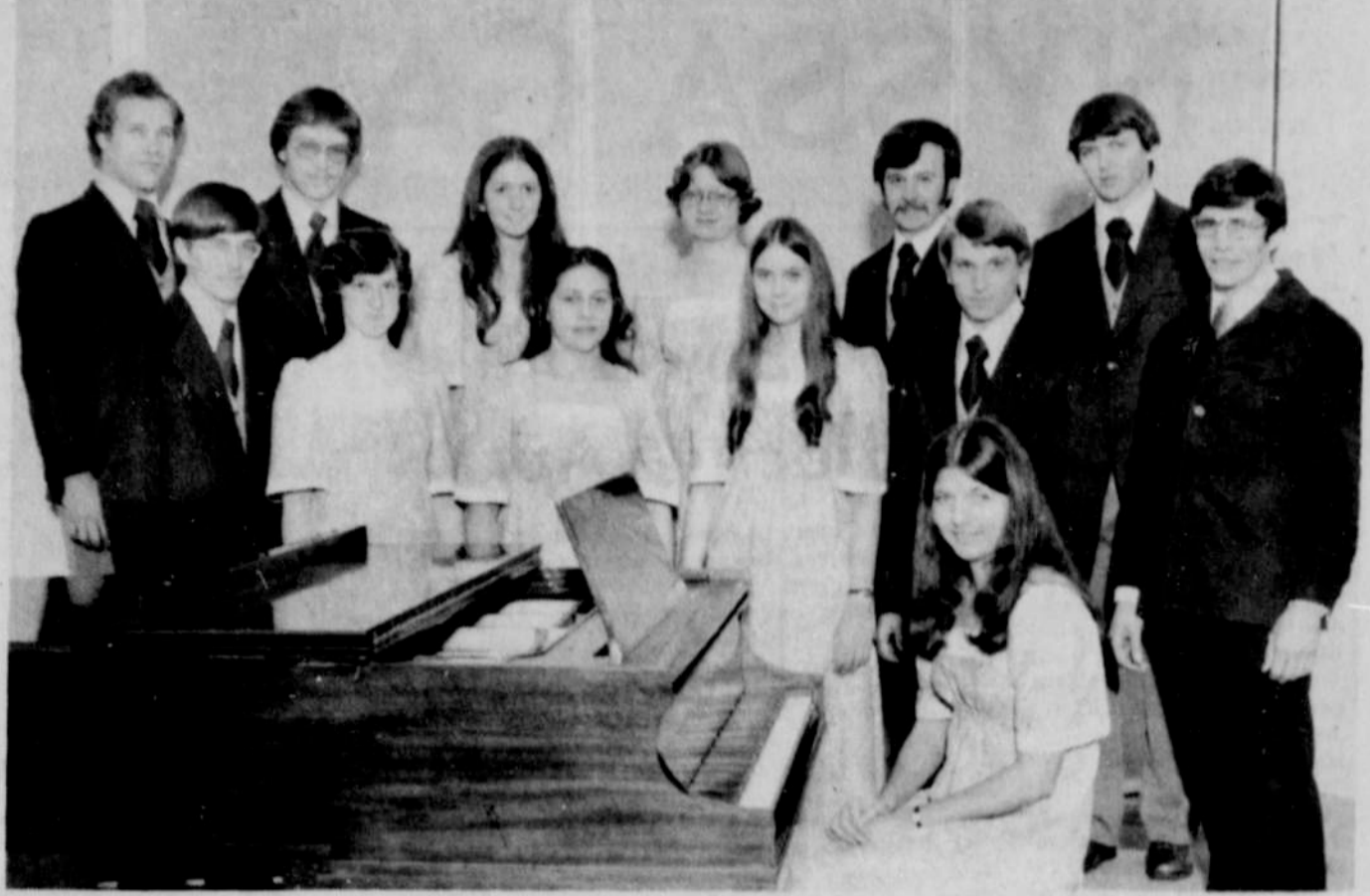
SANDALWOOD, A TWELVE VOICE ENSEMBLE from Montana Institute of the Bible, Lewiston, Montana, will be in Nyssa the evening of Tuesday, April 5 to present a concert of sacred music in the Owyhee Community Church. The presentation is scheduled for 8 p.m.

"God's way may lead through darkness, but it leads to life and light at last."