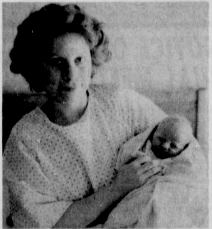
THE NEW YEAR'S BABY was a little late in arriving, but finally came Tuesday, January 11, 1977, at 11:01 a.m., at Malheur Memorial Hospital.

The money from the levy will be used to update hospital facilities, pay a portion of the hospital's operating expenses, and help recruit new physicians for Nyssa.